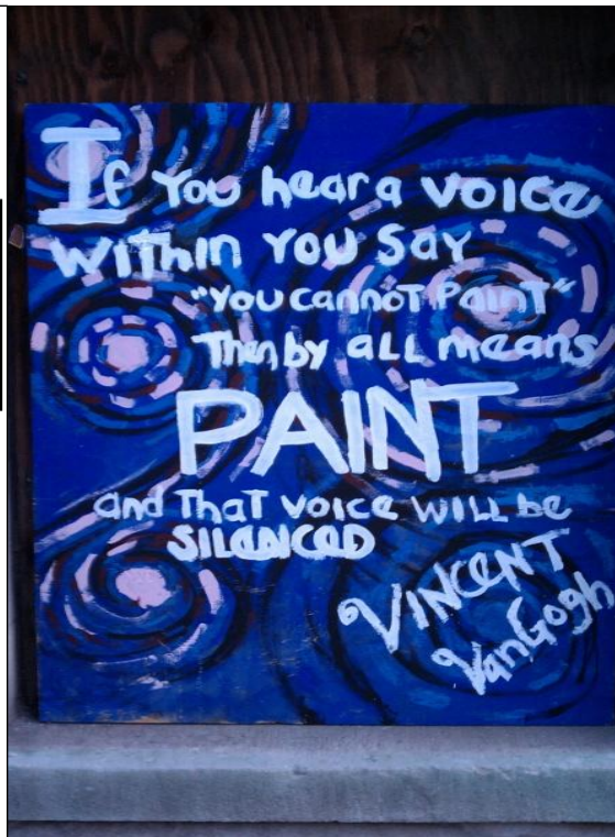
Image from Grand Street Community Arts' BoardedUP event this past September.

"If you hear a voice within you say 'you cannot paint' Then by all means, PAINT and that voice will be silenced" – Vincent Van Gogh