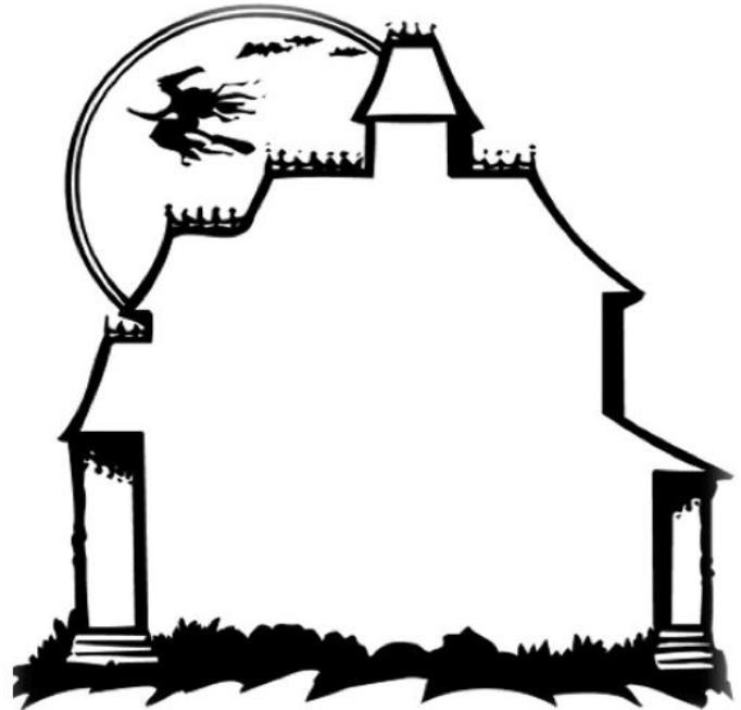
Draw Your Own Haunted House